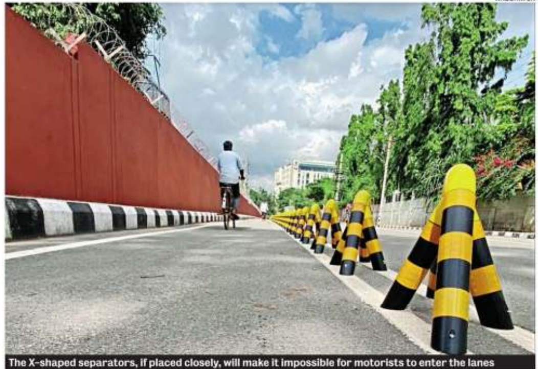
The X-shaped separators, if placed closely, will make it impossible for motorists to enter the lanes

She further informed that one of the designs has already been in-