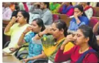
Secretariat staff perform pranayama at Vikasa Soudha

As per information, expenses for the visit are taken from the accounts of the commis-