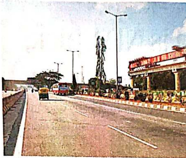
The NHAI is widening the road to six lanes, building service roads, flyovers, underpasses etc.

The move helps in decongesting the traffic on Tumakuru Road that connects