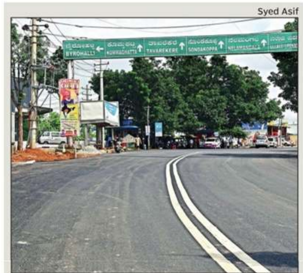
SMOOTH WORK: A road in Kammaghatta, Kengeri, that was asphalted ahead of PM Modi's visit