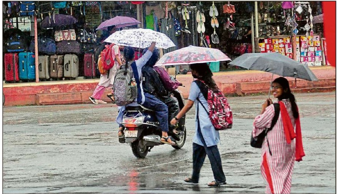
Umbrellas come out as skies open up in Udupi.

Incessant showers have left several residential areas and roads, including high church road, Nandanagadda and railway station road in Karwar flooded. The national highway 66 in front of Ravindranath Tagore beach and the state highway at Habbuwada were inundated with rainwater affecting the vehicular movement for hours. Heavy rain and strong winds battered coastal