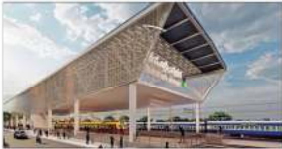
COMING SOON: An artist's impression of a proposed suburban rail station