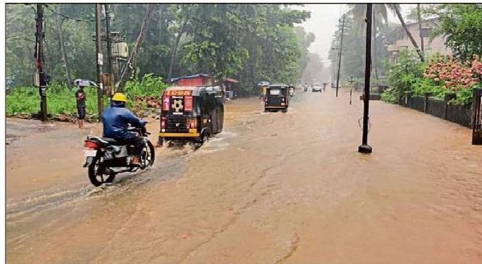
Vehicles navigate a flooded road in Karwar on Tuesday.

taluks of Uttara Kannada - Ankola, Kumta, Honnavar and Bhatkal - throughout the day.