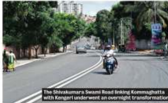
The Shivakumara Swami Road linking Kommaghatta with Kengeri underwent an overnight transformation

To give Bengaluru a new look, BBMP asked its personnel to work day and night for the last one week to ensure that the 14-km road length which Modi travelled on got a makeover. According to BBMP, Rs 2.06 crore was spent to give a facelift to 2.4 km of Kempegowda International Airport Road, Rs 1.55 crore for 0.9 km of Tumakuru Road, Rs 6.05