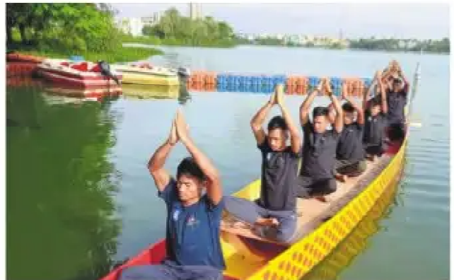
Members of the Kayaking and Canoeing Association of Karnataka perform yoga on Yele Mallappa Shetty lake in KR Puram on Tuesday